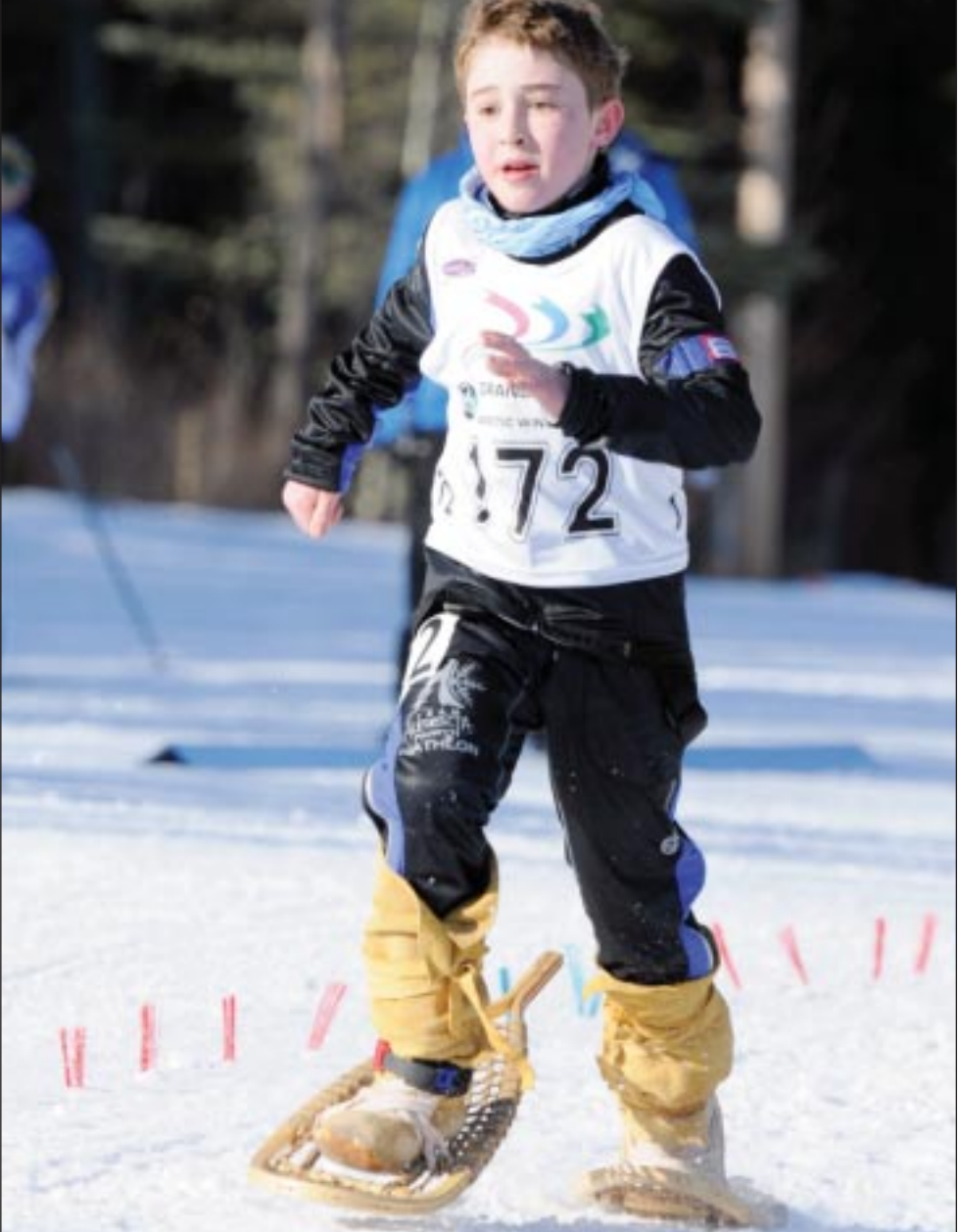
IVAN DANIELEWICZ for Ulu News

2010 Arctic Winter Games and wish you all the best of luck!