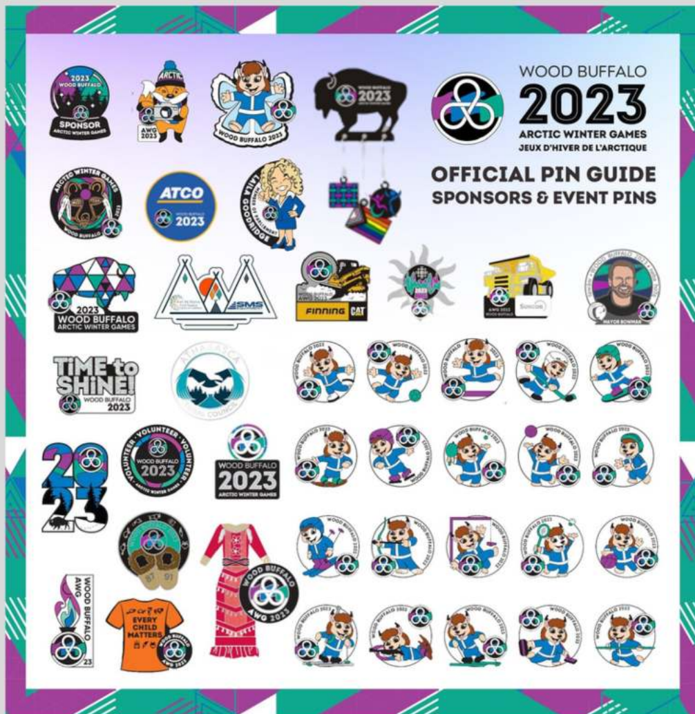
2023 AWG Staff | GRAPHIC FILE

The 2023 AWG Official Pin Guide indicated all the pins to purchase, earn or track down from sponsors and officials. Collectors can stop by the Pin Trading Post at Suncor Community Leisure Centre at MacDonald Island Park from January 29 to February 4.