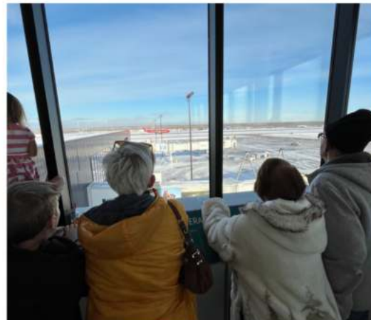
2023 ULU NEWS Spectators watch Air Greenland's flight arrive from the YMM Observation Area on Friday afternoon.

Alaska Airlines Salmon-30-Salmon landed at YMM on Saturday night.