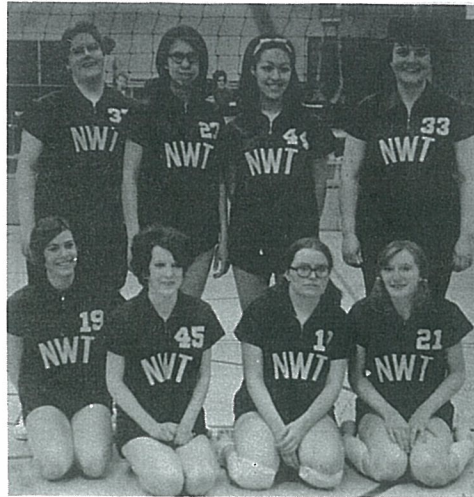
Senior Volleyball Champs