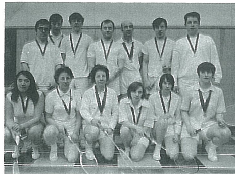
NWT Badminton Team, all single or multiple Gold winners.

and last rock against him, was able to steal one to win the game and the Gold Ulu.