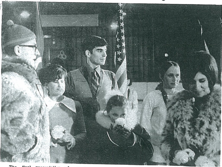
The final presentation of Figure Skating Medals which was dominated by the NWT was made in the Gerry Murphy Arena on Friday afternoon by Senator Lowell Thomas of Alaska who was assisted by 1965 World Figure Skating Champion Petra