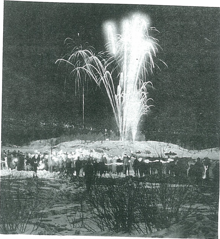
Fireworks complete Games.